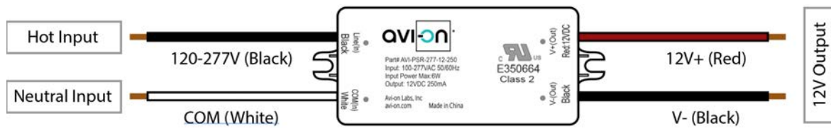
Figure 2. Wiring Diagram